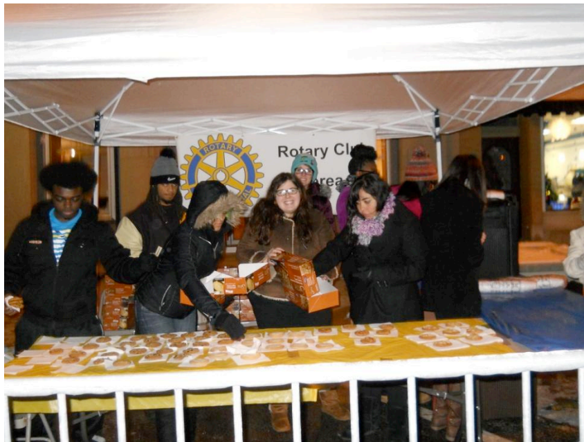
Rotaractors get ready to dish out the cookies.